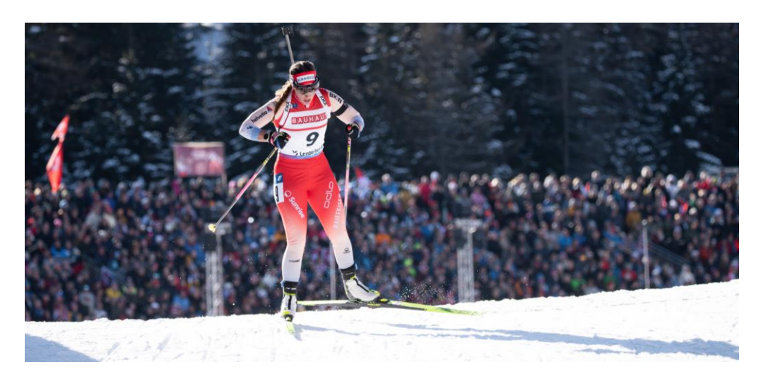
Creation. Motivation. Inspiration.

The focus of the proactive marketing of the holiday region Lenzerheide is placed on the four strategic business areas of Alpine Snow Sports, Nordic, Bike and Families. The main business of Alpine Snow Sports in winter is handled in close cooperation with the Arosa Lenzerheide ski resort. Nordic complements the main business and is promoted together with the Roland Arena. Events with a strong, supra-regional communication impact are organized to reinforce the promotion of the three sports business segments: Lenzerheide hosts the FIS Ski World Cup, the FIS Tour de Ski, the UCI Mountain Bike World Cup and soon the IBU Biathlon World Cup. The Lenzerheide Marketing und Support AG is responsible for the marketing and event support of the vacation region Lenzerheide.